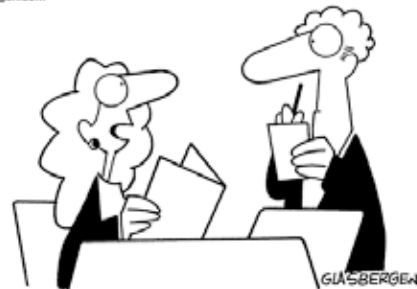
"I'm going to order a broiled skinless chicken breast, but I want you to bring me lasagna and garlic bread by mistake."