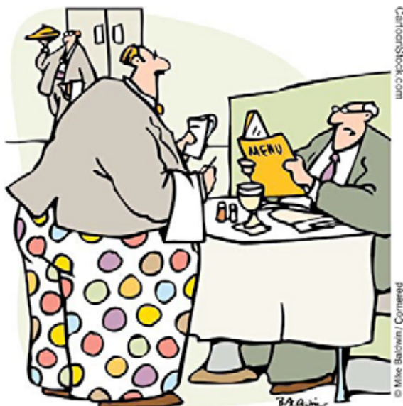
"And what would you suggest, Mr. Smartie Pants?"